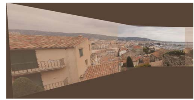
Figure 12: Cannes

Another major failing point is when there is little overlap between the photographs as seen in Figure 12. In this case, it's hard for the algorithm to find enough matching points to determine if two images should be in the same panorama.