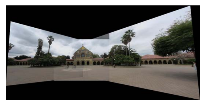
Figure 6: Stanford University Memorial Church

This panorama was the only one taken indoors. The large number of objects in a cluttered environment made it difficult to calculate accurate homography matrices. This is most clear by the blurring near the center of images. The stretching in the images farthest right also makes this images look slightly stretched.