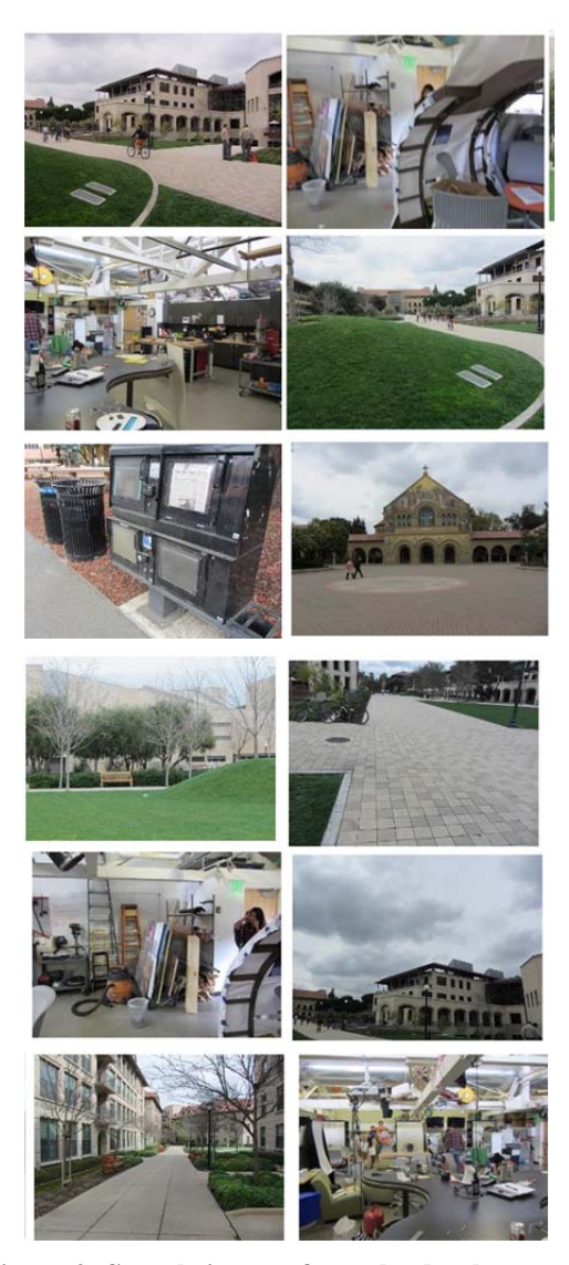
Figure 2: Sample images from the database

The following images are a sample of the about 45 images which were included in the initial database. These images in particular mainly correspond to 8 of the final panoramas while the entire database consists of many more images from a more varied set of locations. These images were taken around the Stanford University campus, in particular the engineering quad, the main quad, and inside the d.School. Figure 2 shows a sample of images from the picture database. Additional pictures taken at a nearby restaurant, London, United Kingdom, Bordighera, Italy, and Cannes, France have been included as well. The extraneous images that do not belong to a panorama have been included were taken at Stanford. The final image database size is 80 pictures after the addition of the images taken in Europe.