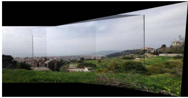
Figure 11: Bordighera, Italy

Here is one more example showing a successful cluster and panorama in a relatively easy setting with grass, sky, and distinctive structures.