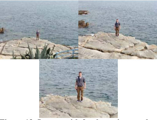
Figure 13: Images with few keypoint matches

Other failure points include when a person moves greatly between photos as seen in Figure 13. This has the potential for a single homography to be calculated based on the moving person or object rather than the background which causes problems when trying to calculate inliers. The algorithm also fails when the image quality is poor with many occlusions and illumination issues as seen in Figure 14.