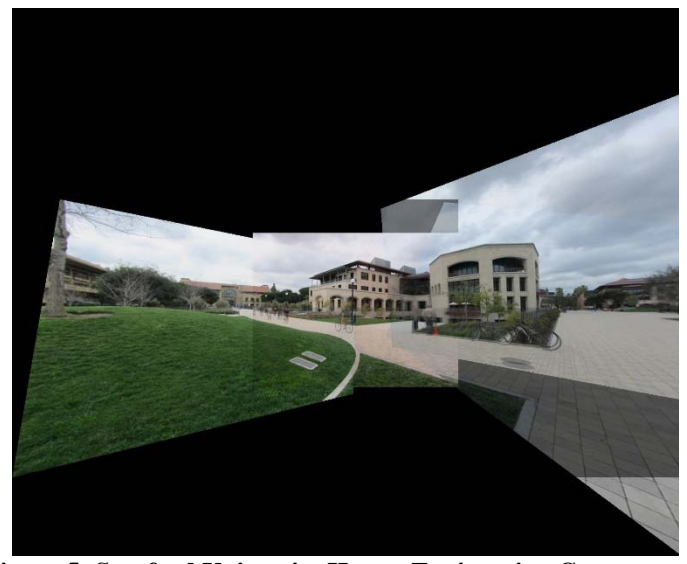
Figure 5: Stanford University Huang Engineering Center

This panorama was taken outside of the Huang engineering center at Stanford University. It worked quite well and contained elements of grass, a tiled surface, buildings and sky. As the images were taken at multiple images, a large distortion is evident.