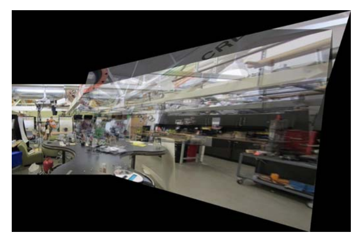
Figure 7: Stanford University ME310 Loft

This panorama was the only one taken indoors. The large number of objects in a cluttered environment made it difficult to calculate accurate homography matrices. This is most clear by the blurring near the center of images. The stretching in the images farthest right also makes this images look slightly stretched.