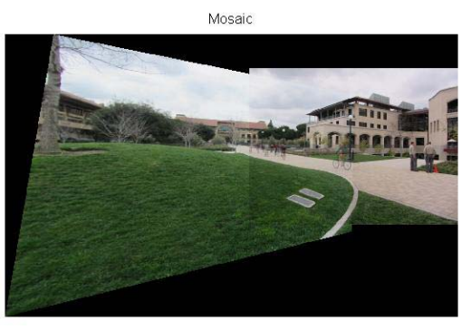
Figure 4: Sample of two stitched images

After a directory of all the images in a single panorama has been created, the two images with the largest number of keypoint matches inside this directory are used for stitching. The first step in this process is to calculate the best homography in a similar way to how it was being done before. Using this homography, one image is warped to be in the same frame as the other and a new image of all black pixels is created which can fit both images in the new frame. An example of this can be seen in figure 4.