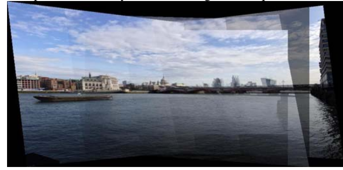
Figure 8: London, Thames River

The images in this panorama were more uniform then many of the others since the water and sky stretched through each. This did not prove a difficulty as the stitching worked quite well.