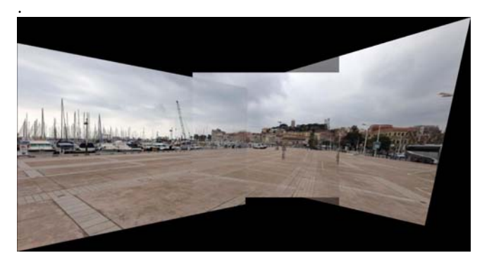
Figure 9: Cannes, Port

Another fairly uniform image which worked quite well. The clustering was quite easy due to the uniformity of the panorama